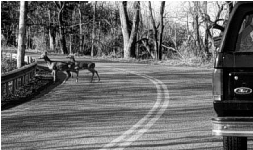
Figure 14. Deer often travel in family groups, so motorists should be cautious if one or more deer are seen on the roadside.

Highway departments install fencing along roadsides for many reasons in addition to preventing deer-vehicle collisions. The effectiveness of fencing for reducing numbers of deer-related accidents is limited unless properly maintained “deer-proof” fences are installed (Falk et al. 1978, Feldhamer et al. 1986). Romin and Bissonette (1996) reported that only ten states used fencing combined with overpasses/underpasses to lower deer-vehicle accidents, but more than 90 percent of state highway departments indicated fencing was effective for preventing animal-vehicle collisions. A 90 percent reduction in deer-vehicle accidents was achieved along a 7.8-mile section of I-70 in Colorado after the construction of an eight-foot-high deer fence (Ward 1982). Accident rates were also reduced in Minnesota (Ludwig and Bremicker 1983) and Pennsylvania (Faulk et al. 1978, Feldhamer et al. 1986) by constructing “deer-proof” fences. It appears that deer rarely jump nine-foot fencing (Feldhamer et al. 1986). Fencing must be frequently inspected with breaks or erosion gullies quickly repaired, because deer will find gaps or weak points where they can cross (Foster and Humhprey 1995, Ward 1982). Bashore et al. (1985) concluded that fencing was the cheapest and most effective method for reducing deer-vehicle collisions along short stretches of highway.