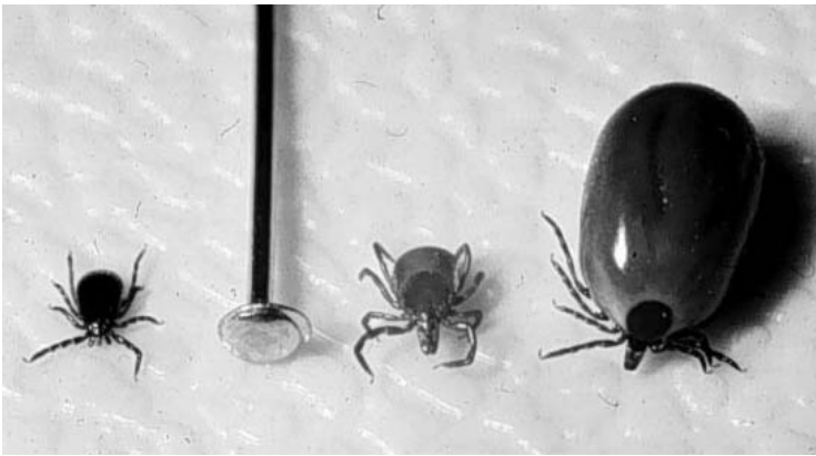
Figure 2. Male, female, and engorged black-legged ticks, with stick pin as reference.

Agricultural producers have indicated that deer cause more damage than other wildlife species (Conover and Decker 1991, Conover 1994, Wywiałowski 1994). Agricultural damage by deer was greatest in the northeastern and northcentral United States, with at least 41 percent of producers reporting damage (Wywiałowski 1994). Conover (1997) conservatively estimated annual deer damage to agriculture at $100 million.