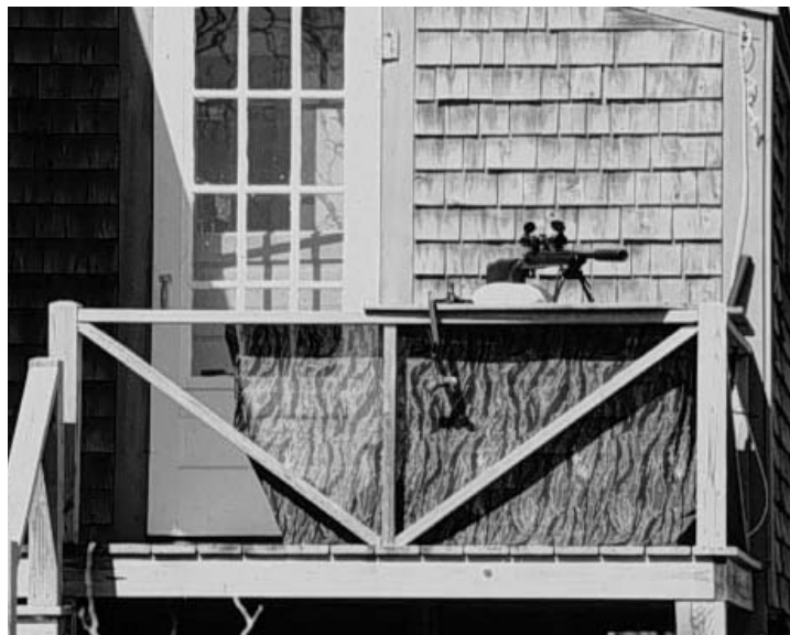
Figure 17. Blind and rifle on a raised deck used as a sharpshooting station

Several communities have employed trained, experienced personnel to lethally remove deer through sharpshooting (Figure 17) with considerable success (Deblinger et al. 1995, Drummond 1995, Jones and Witham 1995, Stradtman et al. 1995, Ver Steeg et al. 1995, Butfiloski et al. 1997, DeNicola et al. 1997c). A variety of techniques can be used in sharp-