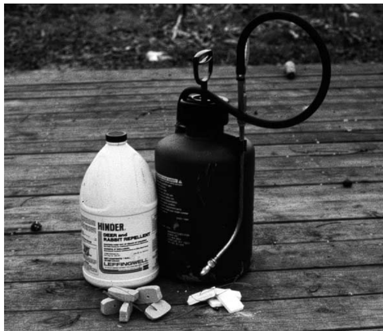
Figure 8. Several commercial repellents may reduce feeding damage for five or more weeks depending on deer foraging pressure and density.

Putrescent whole egg solids are the active ingredient in several odor-based, fear-inducing repellents (e.g., Deer-Away, Deer-Off, Deer Stopper, Big Game Repellent) that have been shown to be effective in