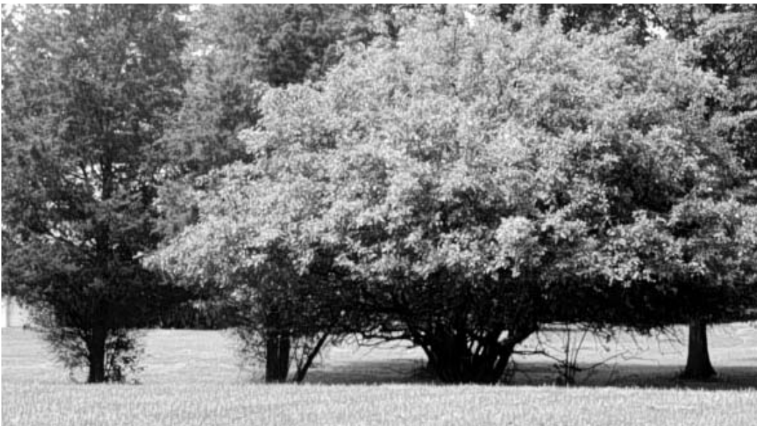
Figure 3. Overabundant deer remove vegetation to a height of approximately six feet, creating a browseline.