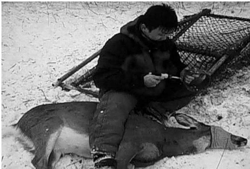
Figure 15. Using netted cages (Clover traps) for capture of deer

With any technique, the cost per deer handled will increase as the proportion of the population removed or treated increases (Rudolph et al. 2000). High costs associated with diminishing returns may prevent achieving population goals with some techniques. Deer learn to avoid threatening situations, and the use of a variety of methods to capture or kill deer can help maintain program efficiency.